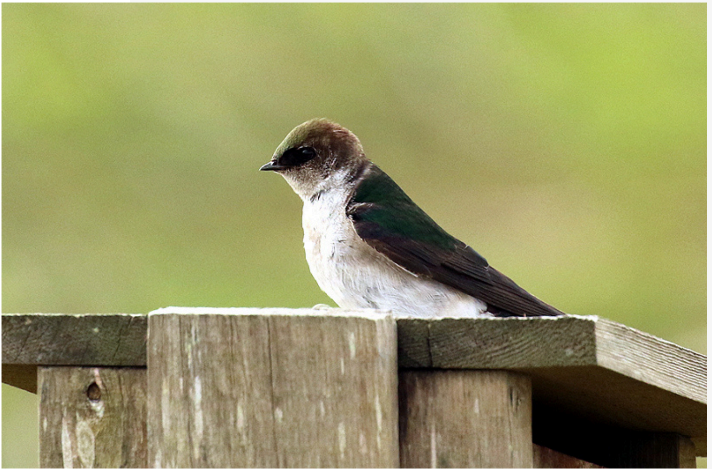
Violet Green Swallow in the Cowichan Estuary.