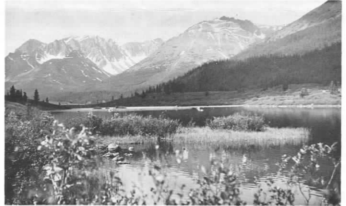
TROUT LAKE - SPATSIZI

The fact that, unlike so many other parks and wild areas in this province, there are no conflicts with either logging or mining interests in the Spatsizi Park enhances the opportunity to manage it as a true wilderness where the