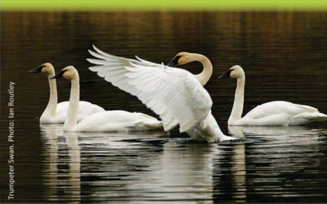
Trumpeter Swan.

The Important Bird & Biodiversity Areas Program of BirdLife International brings people around the world together, to identify, monitor and conserve exceptional places for birds and nature.